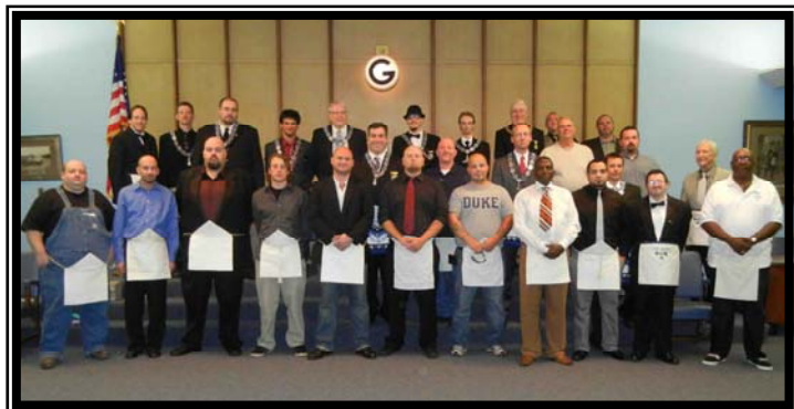
Entered Apprentice Degree on September 19, 2011. Nine New Members, Officers, and Distinguished Guests.